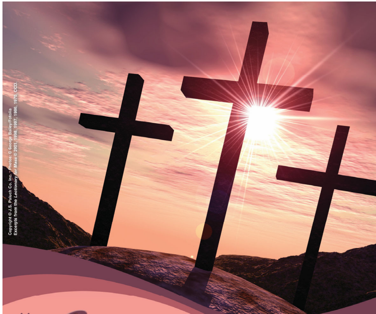
Copyright © U.S. Plunk Co., Inc. Excerpted from the Lectionary for Mass © 2001, 1994, 1997, 1996, 1970, CCL.

“Amen, I say to you, today you will be with me in Paradise.”