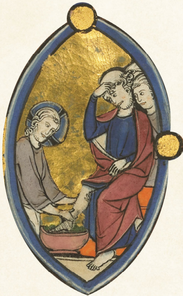
Detail, Anonymous, Christ Washing the Apostles' Feet , Paris, c. 1250-1260

TWENTY-NINTH SUNDAY IN ORDINARY TIME OCTOBER 17, 2021